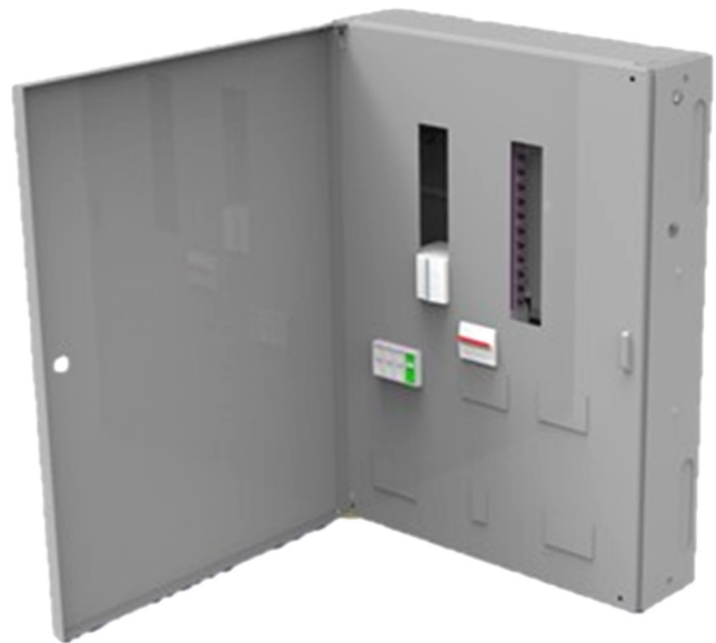
General appearance with 125A switch disconnector incomer

While Dorman Smith Switchgear and its affiliates referenced herein have made every reasonable effort to ensure the accuracy of the information contained in this catalogue, Dorman Smith Switchgear cannot assure that this information is error free. For this reason, Dorman Smith Switchgear does not make any representation or offer any guarantee that such information is accurate, correct, reliable or current. Dorman Smith Switchgear reserves the right to make any adjustments to the information at any time. Dorman Smith Switchgear expressly disclaims any implied warranty regarding the information contained herein, including, but not limited to, the implied warranties of merchantability or fitness for a particular purpose. Dorman Smith Switchgear only obligations are those stated in Dorman Smith Switchgear Standard Terms and Conditions of Sale. Dorman Smith Switchgear will in no case be liable for any incidental, indirect or consequential damages arising from or in connection with, including, but not limited to, the sale, resale, use or misuse of its products. Users should rely on their own judgement to evaluate the suitability of a product for a certain purpose and test each product for its intended application. Dorman Smith is a trademark.